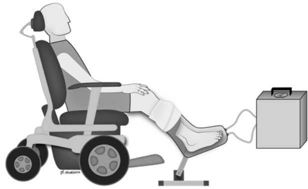
Fig. 1 Illustration of the home-based INP device. The participant's lower leg and foot with the ulcer was placed in a subatmospheric pressure chamber interfaced with the pressure control system delivering INP. See text for further explanation. Illustration: Øystein H. Horgmo, University of Oslo

baseline, which included a description of the treatment protocol along with a tutorial on how to operate the device.